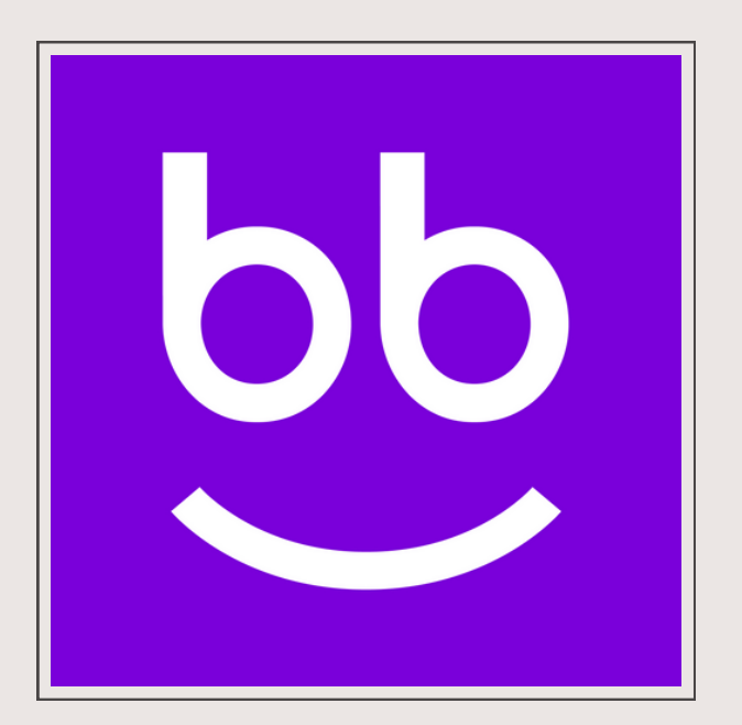
N I B B L E Interactive lessons and quizzes to help users learn new things